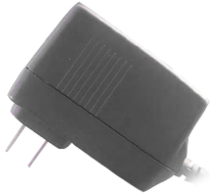
Dimension : 85mm(L) x 35mm(W) x 60mm (H)